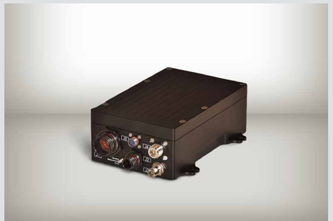
AIS - Automatic Identification System